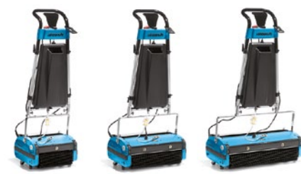
R30B R45B R60B